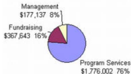
Expenses - $2,320,782

“As Treasurer of the Board of Directors it is apparent that SONM has made some great strides to strengthen its overall financial health over the past ten years. We have grown our total assets by more than 76% and have done this without increasing liabilities. The most exciting component of growth is the fact that program service expenses have grown from approximately $995,000 to $1,776,000 and that $.77 of every dollar spent goes to program services.”